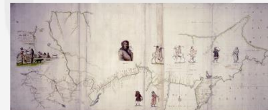
Peter Chaplin's Map of Siberia (1729).