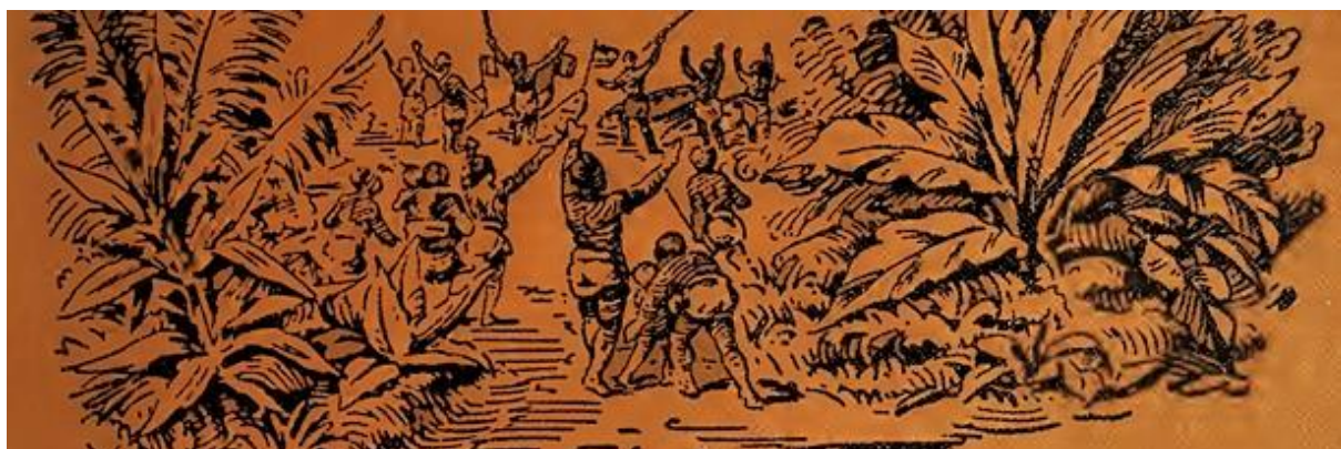
Detail from the cover of Hermann Wissman's Meine Zweite Durchquerung Äquatorial-Afrikas , 1890.

To subscribe to the BEROSE quarterly Newsletter, enter your email address here .